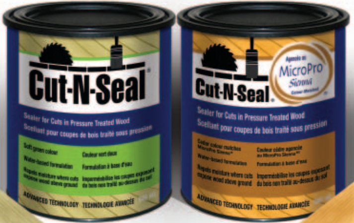
Cut-N-Seal® Soft Green